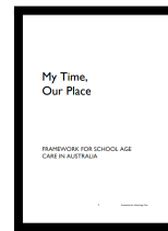
My Time, Our Place; Framework for School Age Care in Australia 2022 V2

Critical reflection: is a meaning-making process that assists informing future practice in ways that demonstrate an understanding of each child’s learning, development and wellbeing and implications for equity and social justice. It involves examining and analysing events, experiences and practices from a range of perspectives to inform future planning and decision-making ( Early Years Learning Framework 2022 V2 – refer to Sources ).